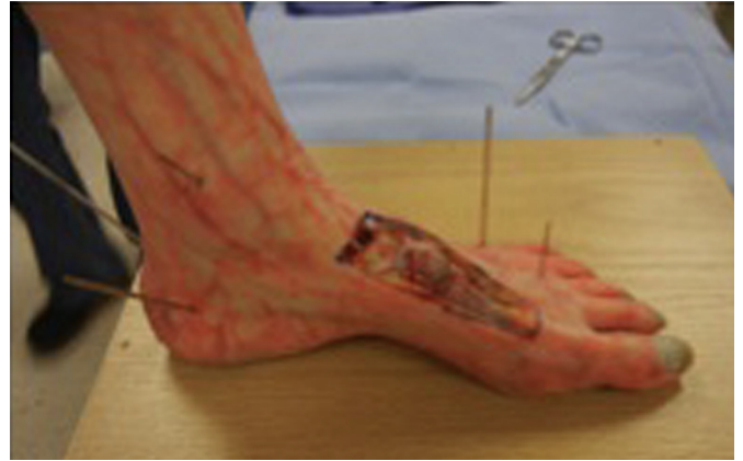
Fig. 2. Dissection of the metatarsal-cuneiform joint release with no bone resection.

Five fresh-frozen cadaveric specimens were obtained for the purposes of the present study. All 5 of the specimens were obtained from female cadavers. Three were left feet and two were right feet. The mean age at death was 86 years old. Each specimen was examined clinically to determine whether any gross deformities were present, including HAV deformity. No gross forefoot or midfoot deformities were noted in any of the specimens. Each specimen was placed in the neutral position and fixated to a stabilizing block with multiple Kirschner wires: through the ankle joint to