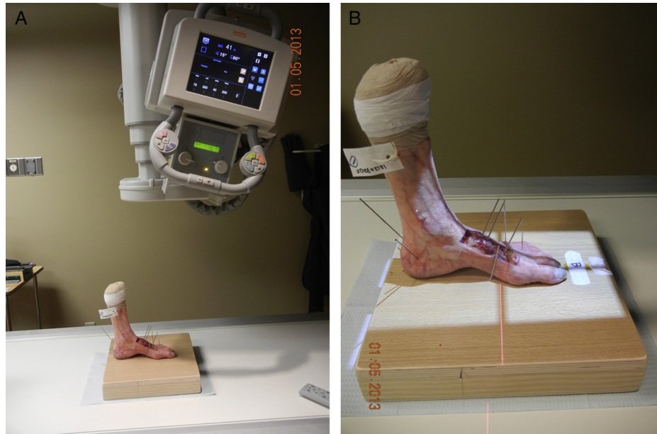
Fig. 4. A standard radiographic technique was used for each specimen.

specimen was discarded. Of the 4 specimens included in the analysis, none had had a pre-existing HAV deformity or gross forefoot or midfoot deformity. The raw data, consisting of the mean measurements for PASA, IMA, HAA, and TSP for each point of valgus and varus rotation, are listed in Table 1. The data were analyzed using a mixed linear model to compare the change in each measurement over the range of valgus and varus rotation. The change in the TSP was significant in both valgus and varus rotations ( p = .0004 and p = .028 , respectively), showing that an increase in valgus rotation results in an increase in the TSP and an increase in varus rotation results in a decrease in the TSP. Changes in the IMA were significant compared with valgus rotation ( p = .028 ), showing that as the valgus rotation increased, the IMA also increased. However, when the IMA was compared with the varus rotation, the correlation was not significant ( p = .18 ). When the mixed linear model was applied to the PASA and HAA measurements with metatarsal rotation, our results showed positive trends, but the differences were not statistically significant (Table 2).