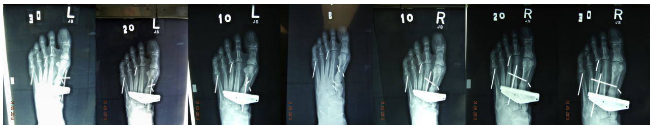
Fig. 5. Radiographic images showing rotation from the original baseline image (B), 10^\circ valgus (10 L), 20^\circ valgus (20 L), 30^\circ valgus (30 L), 10^\circ varus (10 R), 20^\circ varus (20 R), and 30^\circ varus (30 R).