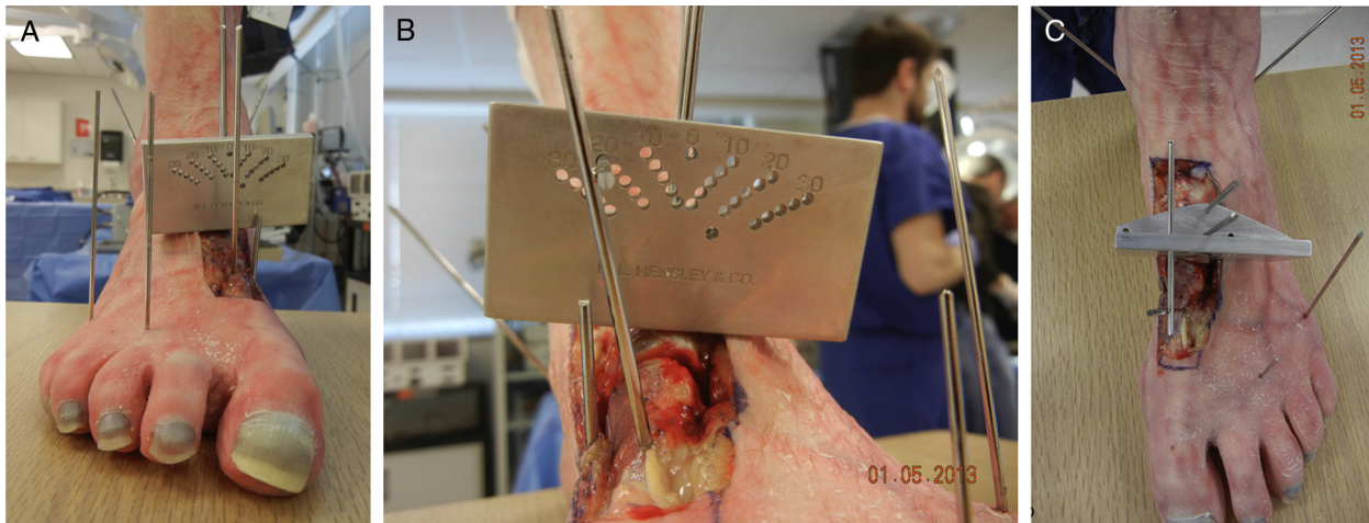
Fig. 3. (A) Joint rotation calibrated at 0° before metatarsal-cuneiform joint release and pin fixation. (B) Method of rotation using measuring device. In this instance, the rotation was 20° in valgus. (C) The method of measurement of rotation with custom-measuring device.

The bone quality of 1 of the specimens was not adequate to withstand the rotational forces on the pin; therefore, the amount of rotation could not be accurately measured. The data from that