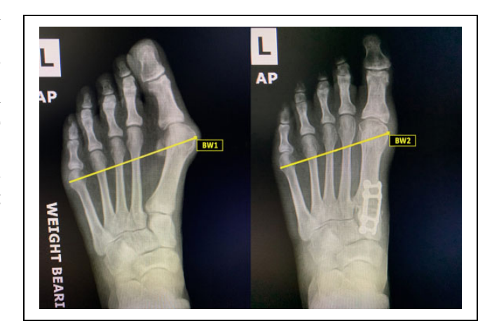
Figure 1. Weightbearing radiographs showing changes in bony width preoperative (BW1) and postoperative (BW2) after triplanar first tarsometatarsal arthrodesis. Bony width was defined as the distance from the most medial aspect of the first metatarsal head to the most lateral aspect of the fifth metatarsal head.

screw for intercuneiform instability was required in 61 patients (41.2%).